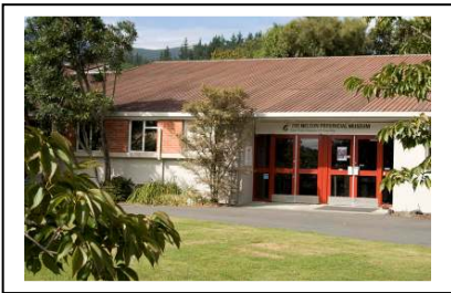
FIGURE 3. Nelson Provincial Museum's Research Facility, Isel Park, Stoke.