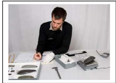
FIGURE 8. Processing collection objects, Ise! Park Research Facility, Stoke.

donors acknowledged and provenance noted; objects are allocated a unique registration/accession number; then photographed, measured and condition reported; objects are then packaged and placed in storage; the location of the object in storage is then recorded; all object data is recorded electronically (Figure 8).