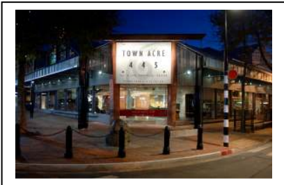
FIGURE 2. TA445, cnr Trafalgar and Hardy Streets, Nelson.

During 2001 Tasman Bays Heritage Trust was setup and through the support and commitment of Nelson City and Tasman District Councils, purchased the former Hotel Nelson site on the corner of Hardy and Trafalgar Streets. This historic site is part of the original Town Acre 445. In October 2005 the museum's exhibition and education centre, TA445 (Figure 2), opened providing the region's community with the opportunity to learn more about themselves, and visitors to New Zealand are able to discover how the region has played a major role in shaping and defining New Zealand's history. The museum's collection of objects, photographs, and library and archive material, remain in Stoke at the Isel Park Research Facility (Figure 3).