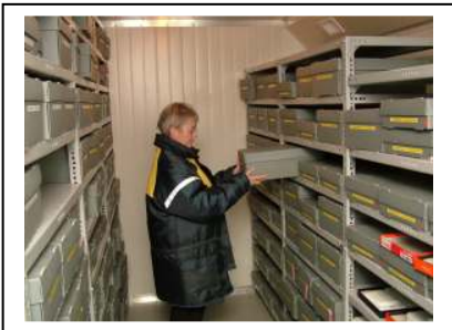
FIGURE 7. Photographic negative cool store, Ise! Park Research Facility, Stoke.

The range of material held by the museum necessitates specialised storage areas, and storage systems, to prolong the life of the objects. Examples are: the collection of acetate, nitrate and colour negatives is stored in a purpose built cool store where temperature and humidity are strictly monitored (Figure 7); in store rooms containing paper based objects light levels are controlled. Objects are stored in acid-free enclosures and boxes where possible, and appropriate. In the collection store rooms objects are housed on metal shelving, much of it compacting, and in metal cabinets.