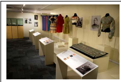
FIGURE 9. Remnants of Past Life section, Unpicking the Past, Nelson Provincial Museum 2008.

In some areas of museum practice little has changed since 1842, a record of the "names of the donors" is still kept. However the emphasis of museum collecting has moved away from solely just the object to now include the object's provenance. Staff at the museum are committed to the development and research of these objects in the collections, and providing access to them, which will inevitably unearth many of the stories of the region's settlement. Researchers using the museum's collections play an important part in this role also. This process of discovery was successfully illustrated by the museum's award winning exhibition Unpicking the Past – revealing our dress collection (Figure 9).