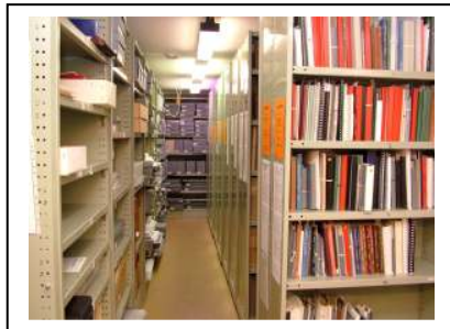
FIGURE 4. Archives storeroom, Isel Park Research Facility, Stoke.

The archival collection (Figure 4) includes: personal papers, letters and diaries of local people describing voyages to Nelson and aspects of life in the Nelson region, the earliest dating from the 1840s; records of organisations, clubs and societies including sports clubs; business records of local firms; records from the Nelson Education Board, including school admission registers and minute books; deeds for sale and purchase of land in the region, the majority dating from 1850s to 1920s; unpublished ephemera, such as tickets and invitations; research papers and theses; manuscript maps and architectural drawings; and an oral history collection, including interviews with local residents and researchers on a range of topics.