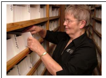
FIGURE 5. Glass plate negative collection, Isel Park Research Facility, Stoke.

undertaking family research, provides authors and researchers a source for illustrating text, and is used extensively in exhibitions and education programs. The collection includes major studio and journalist collections as well as small collections of professional and amateur photographs, albums and single images. A range of media is represented in the collection from daguerreotypes and opals to glass plate negatives, lantern slides and modern transparencies (Figure 5).