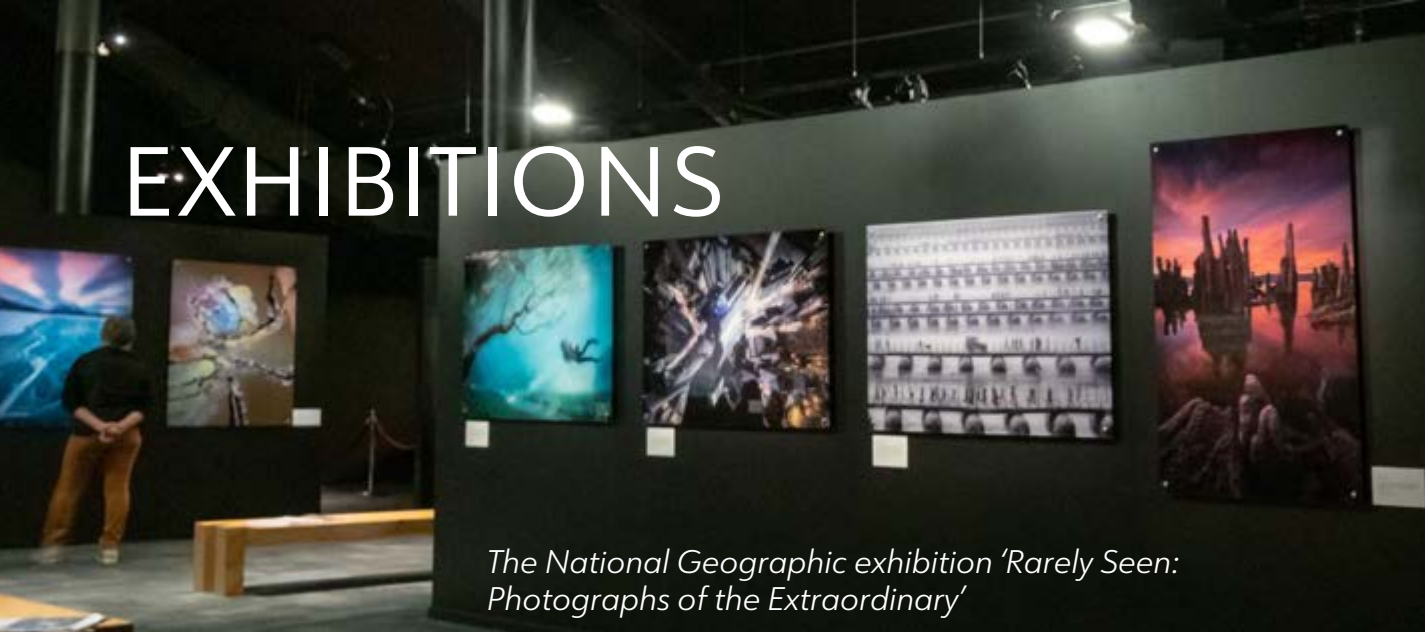
The National Geographic exhibition 'Rarely Seen: Photographs of the Extraordinary'