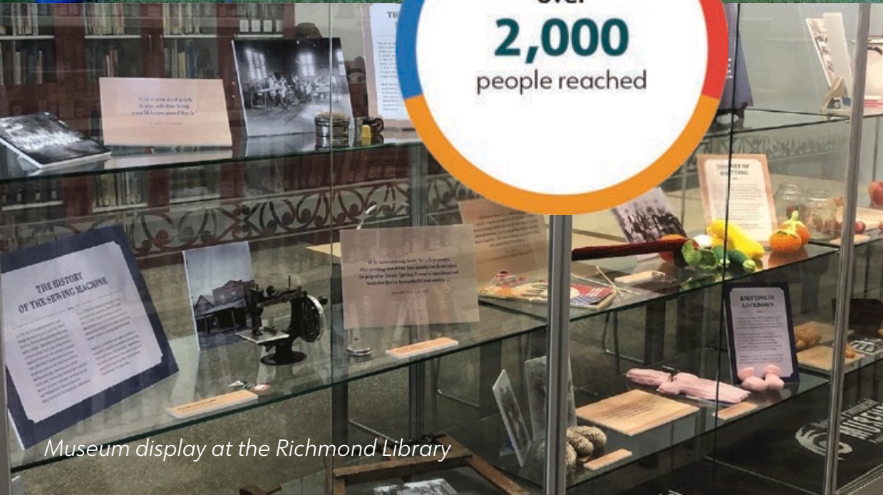
Museum display at the Richmond Library