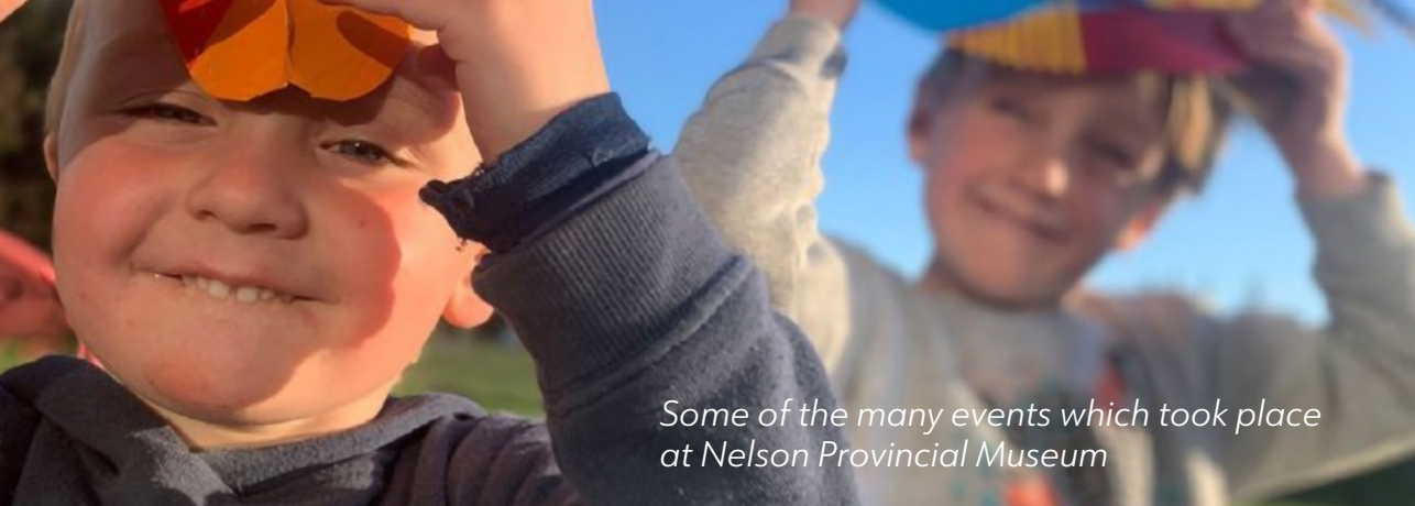
Some of the many events which took place at Nelson Provincial Museum