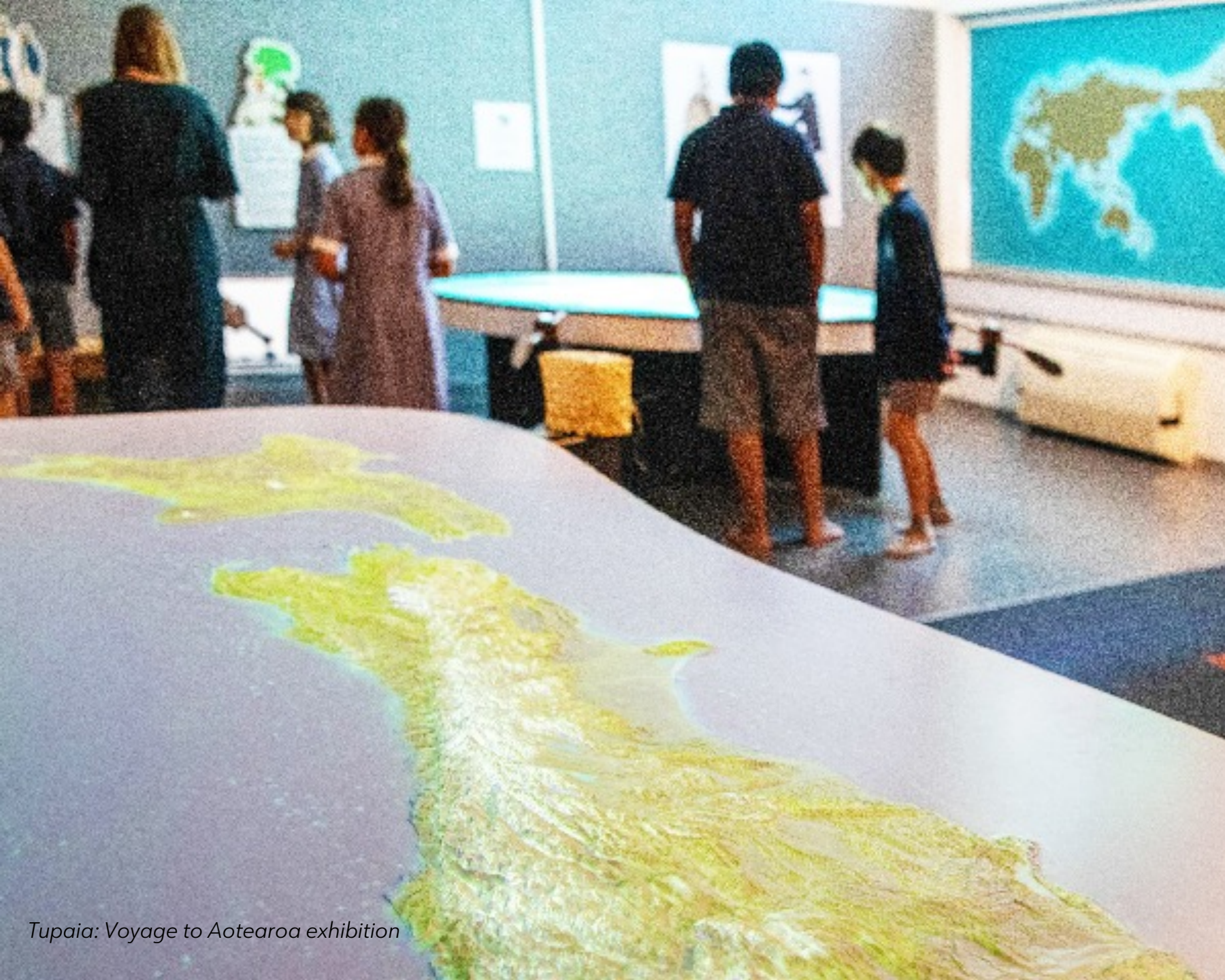
Tupaia: Voyage to Aotearoa exhibition