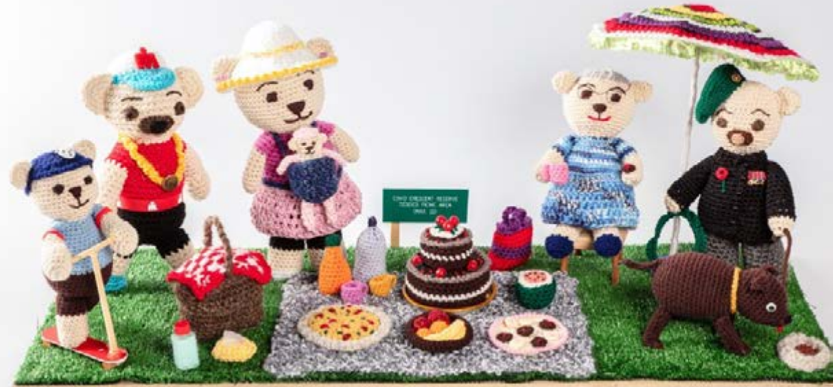
Crocheted Diorama, Teddy Bear Picnic. Nelson Provincial Museum Collection: NPM2020.57.1