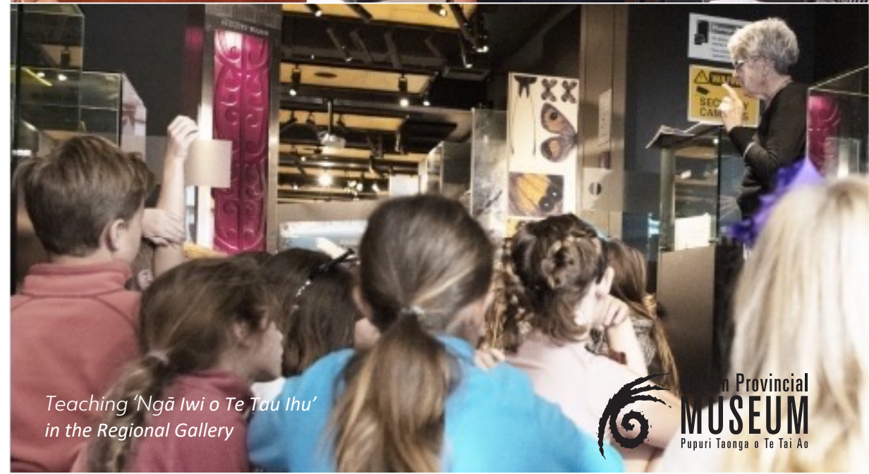
Teaching 'Ngā Iwi o Te Tau Ihu' in the Regional Gallery