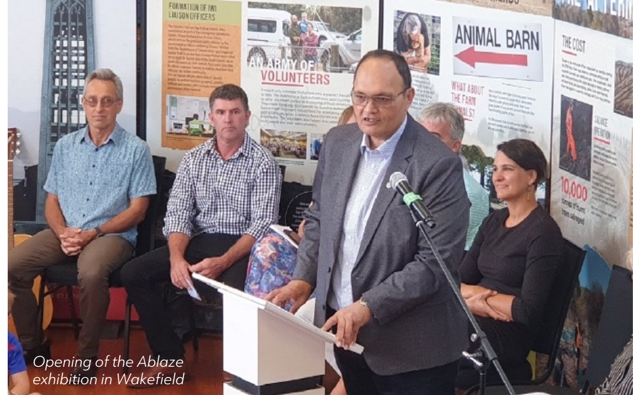
Opening of the Ablaze exhibition in Wakefield