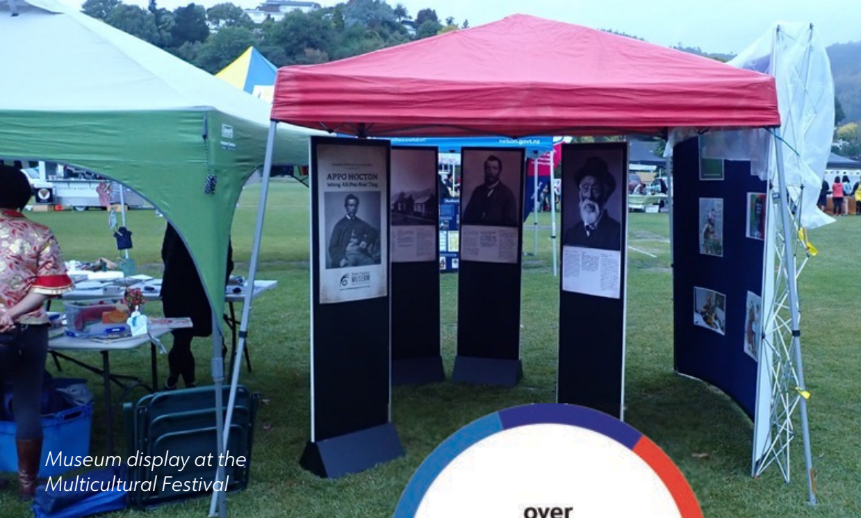
Museum display at the Multicultural Festival