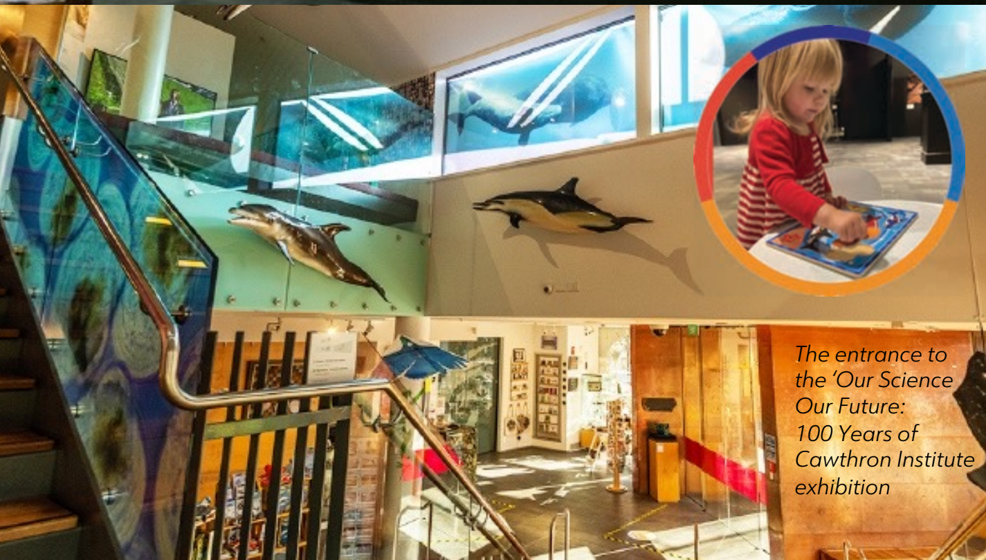
The entrance to the 'Our Science Our Future: 100 Years of Cawthron Institute exhibition'