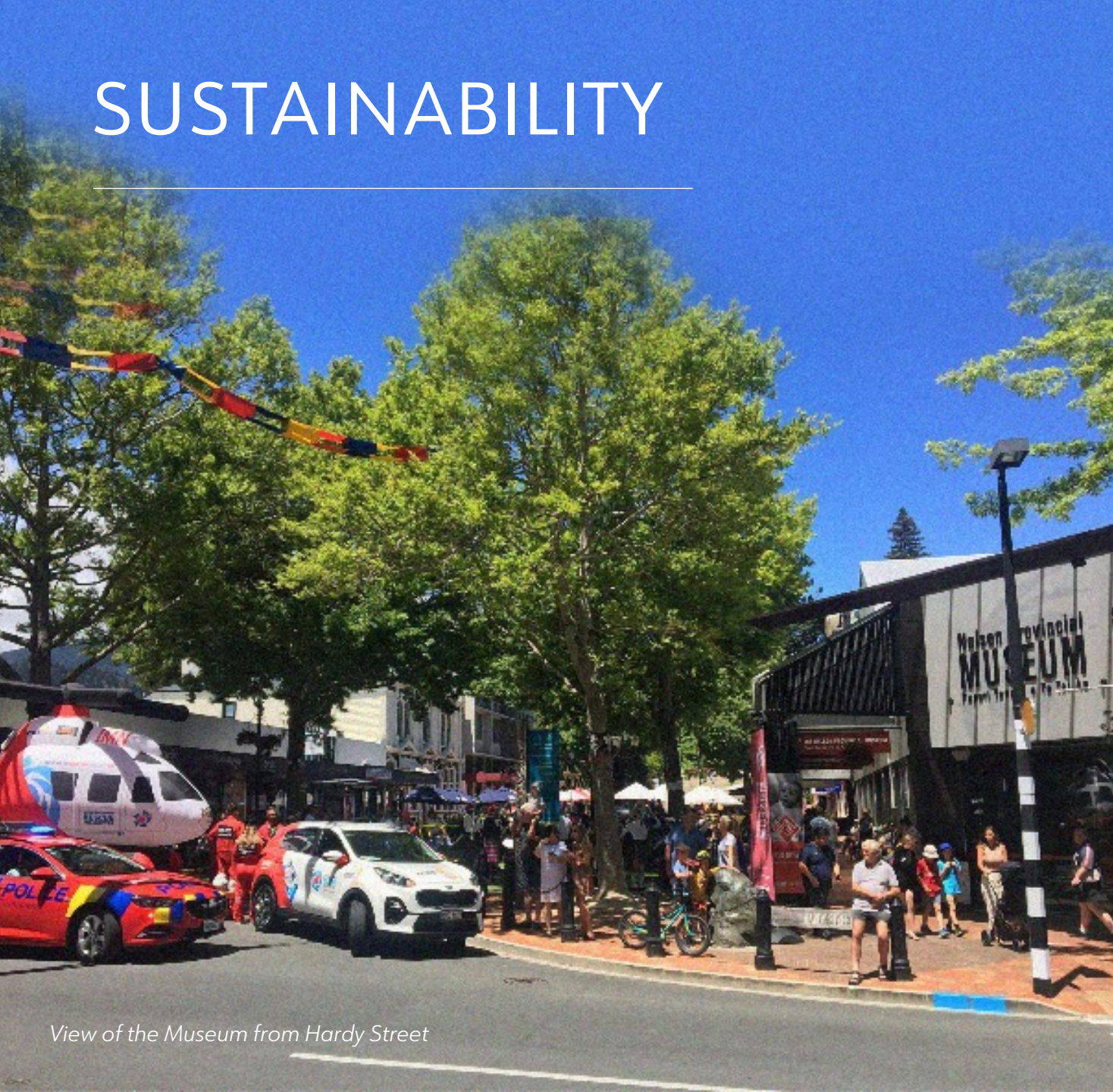
View of the Museum from Hardy Street