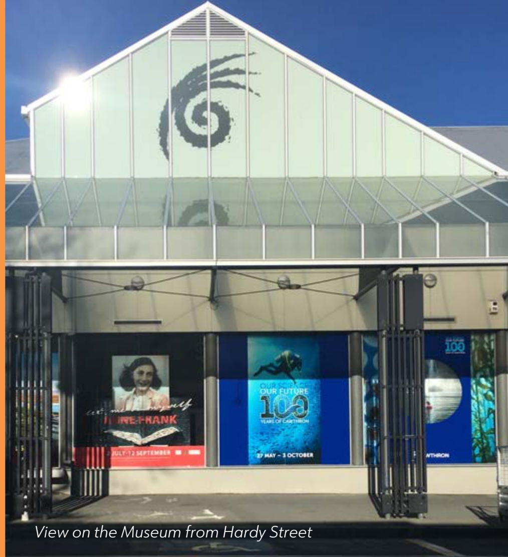
View on the Museum from Hardy Street