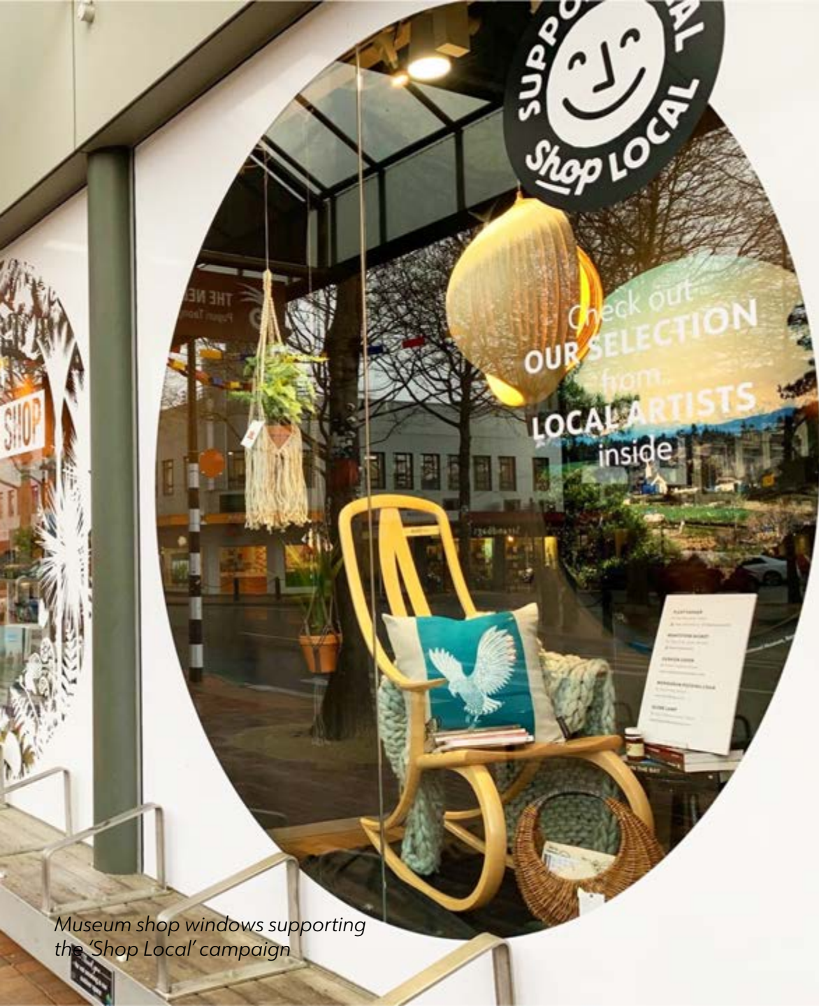
Museum shop windows supporting the 'Shop Local' campaign